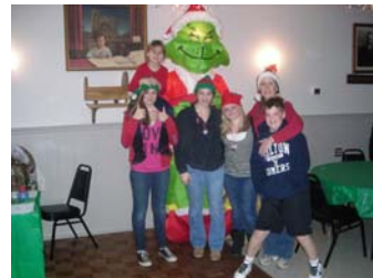
Some of our Elves