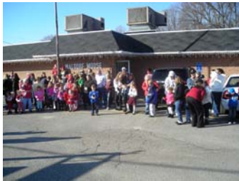
Waiting for Santa

We've outdone ourselves again! We had close to 80 children attend, not counting all the parents and volunteers! Special thanks to Accokeek Volunteer Fire Dept., our 'real' Santa and Mrs. Clause and ALL the volunteers who helped make this party GREAT.