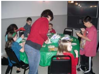
One of the many craft tables