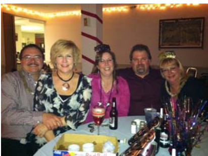
New Year's with friends