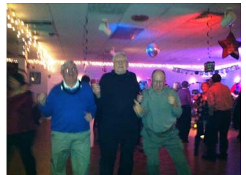
Boogey down boys!!