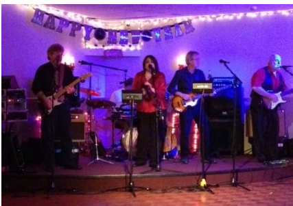
Road House Band