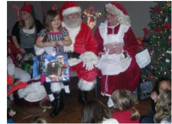
Presents from Santa